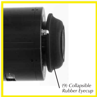
(9) Collapsible Rubber Eyecup

Your Mark Vb Director's Viewfinder has been equipped with a rubber protective eyecup (9), which can be collapsed to a folded position, thus allowing those wearing glasses to position the finder close to the eye for maximum clarity of viewing. The eyecup also prevents the scratching of your glasses.