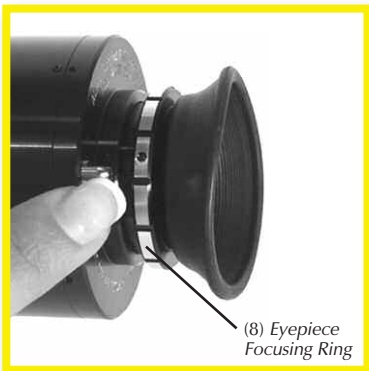
(8) Eyepiece Focusing Ring

The viewfinder optics have been designed to provide a sharp image throughout the entire 12:1 zoom range. The Eyepiece Focusing Ring (8) located just ahead of the Collapsible Rubber Eyecup can be adjusted to accommodate to an individual's eye focus at any given setting.